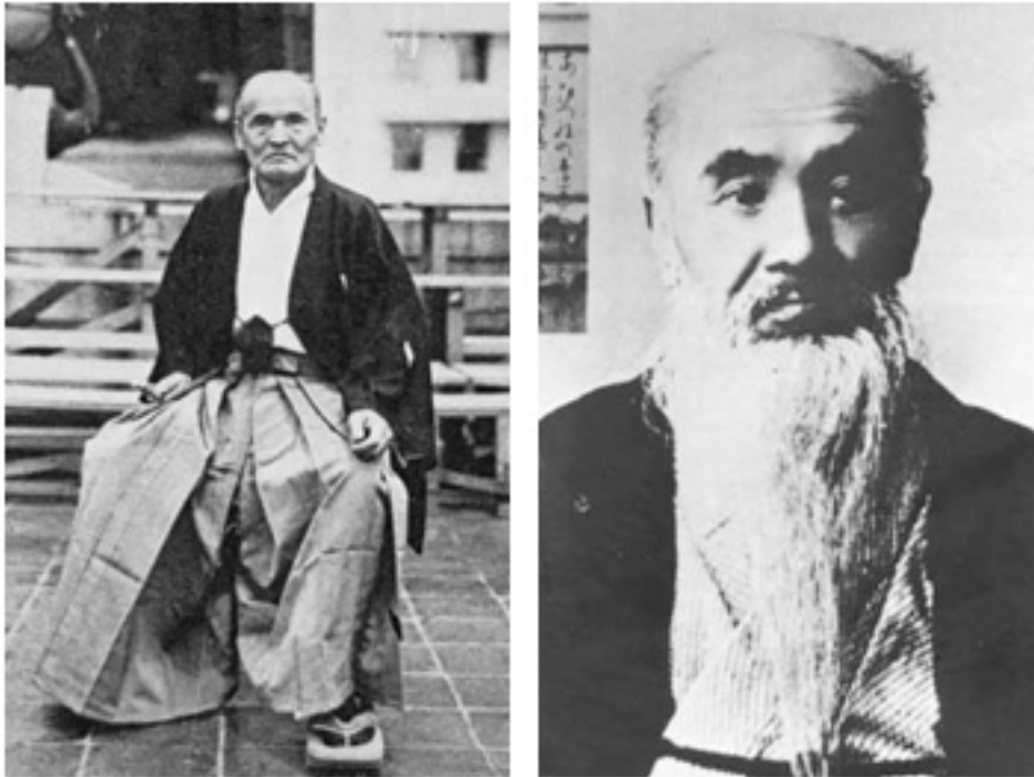
Above left: Sokaku Takeda - Above right: Tanomo Saigo

At the end of the Boshin war, September 22nd 1868, the Aizu clan surrendered, and a new historical chapter began. Some time after, the last Jodai Karo (minister) of the Aizu han, Hoshina Genshin (1830-1905), also known as Chikanori Saigo, or Tanomo Saigo (teacher of oshikiuchi) retired to private work at Nikko Toshogu Shrine. But that was by no means the end of Daito ryu.