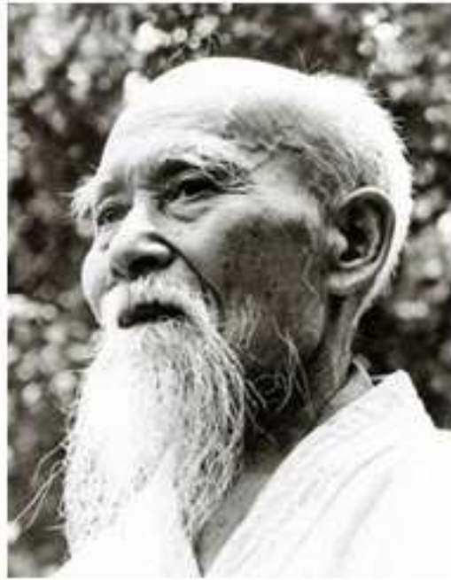
Above: Morihei Ueshiba, Takeda's most famous student.

He was a descendant of Emperor Seiwa, and of Yoshimitsu, and a man strongly attached to the old ways, the ways of the samurai.